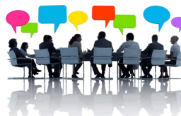
CBME COMMITTEE UPDATES