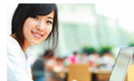
RESIDENT ENGAGEMENT AND WELLNESS MATTERS