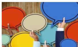
PROGRAM TRANSITIONS TO CBD