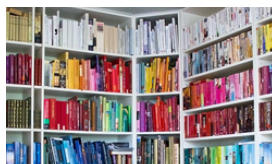
UPDATES FROM RC, CBME OFFICE